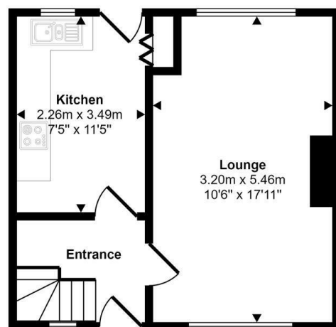
Ground Floor Approx 31 sq m / 331 sq ft

Approx Gross Internal Area 63 sq m / 673 sq ft